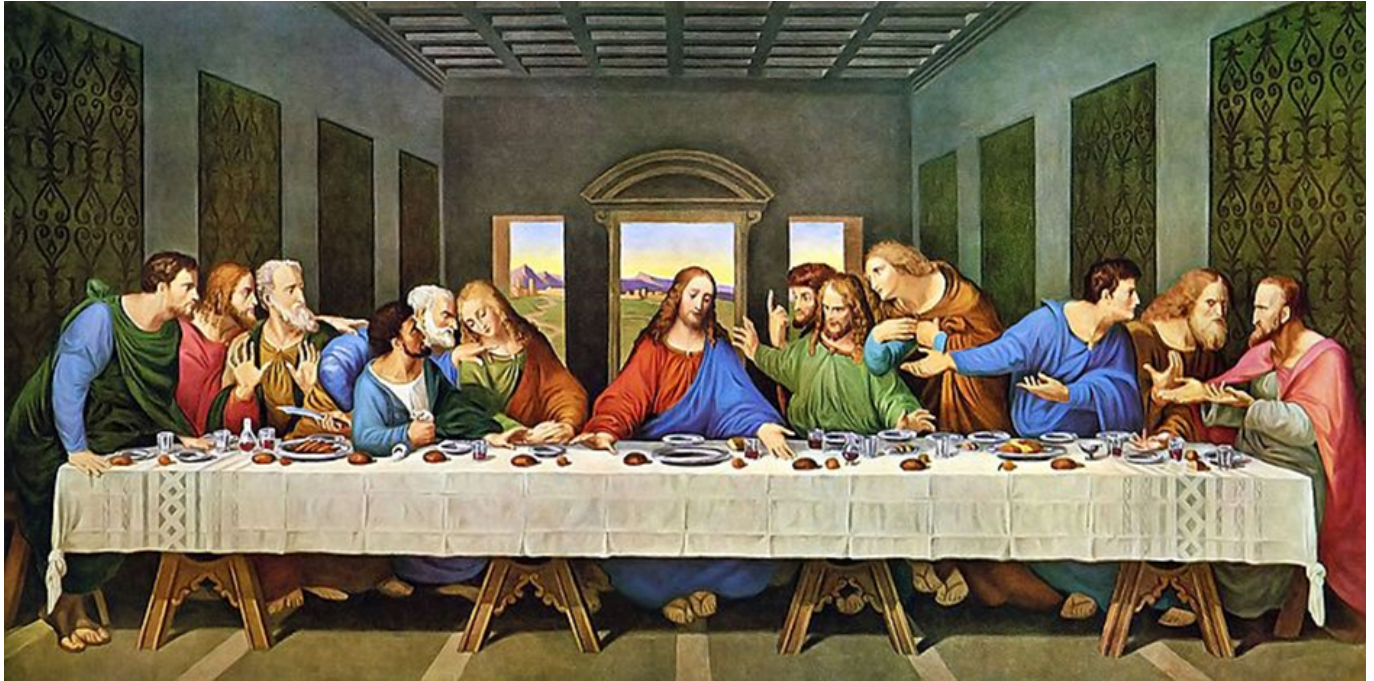
The Last supper, by Leonardo da Vinci. Restored image. As per the fresco in the Santa Maria delle Grazie, Milan.

https://commons.wikimedia.org/wiki/File:The-Last-Supper-Restored-Da-Vinci_32x16.jpg