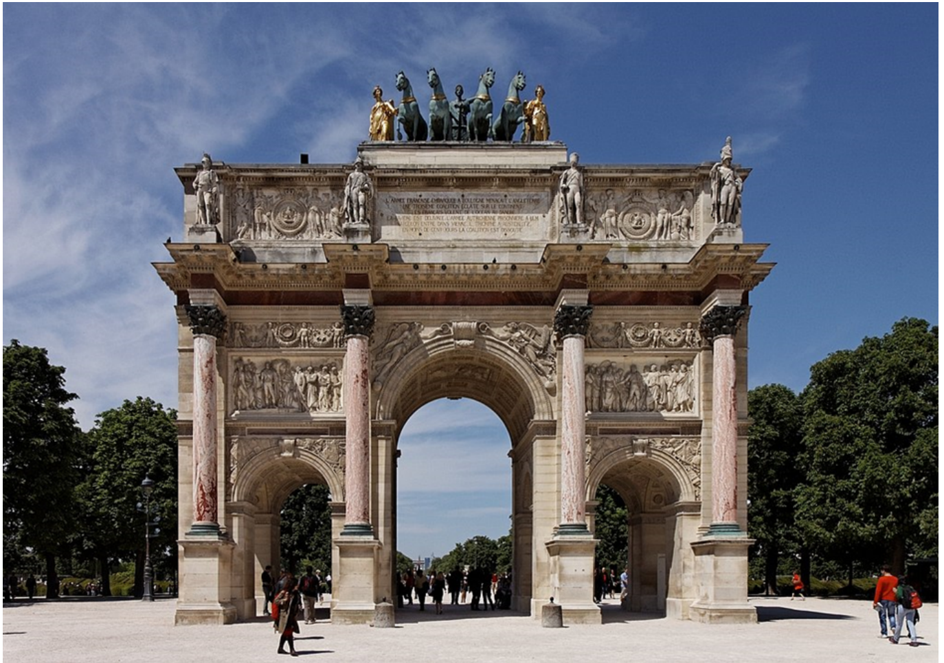
Image: Arc de Triomphe du Carrousel

The triptych symbolism in religious buildings and art. An astronomical clock.