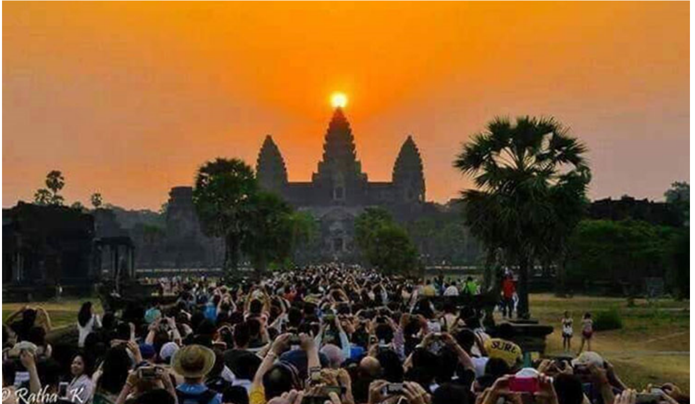
Image: The image of Angkor is identical symbolism to the Notre dame, or the triumphal arches. It's the sun moving over the seasons. The sunrise on Angkor Wat during the equinox is such that someone standing in front of the western entrance on the equinox is able to see the sun rising directly over the central lotus tower. Image :

The triptych symbolism in religious buildings and art. An astronomical clock.