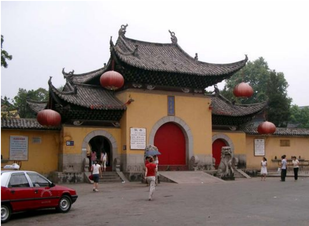
Image: Guiyuan Temple. Wuhan, China

or architectural feature but it's not. Most are in churches or temples and my explanation is that it's a depiction of the sun bouncing up and down our globe during the seasons and the respective position of the sun on the horizon. It's an astronomical clock.