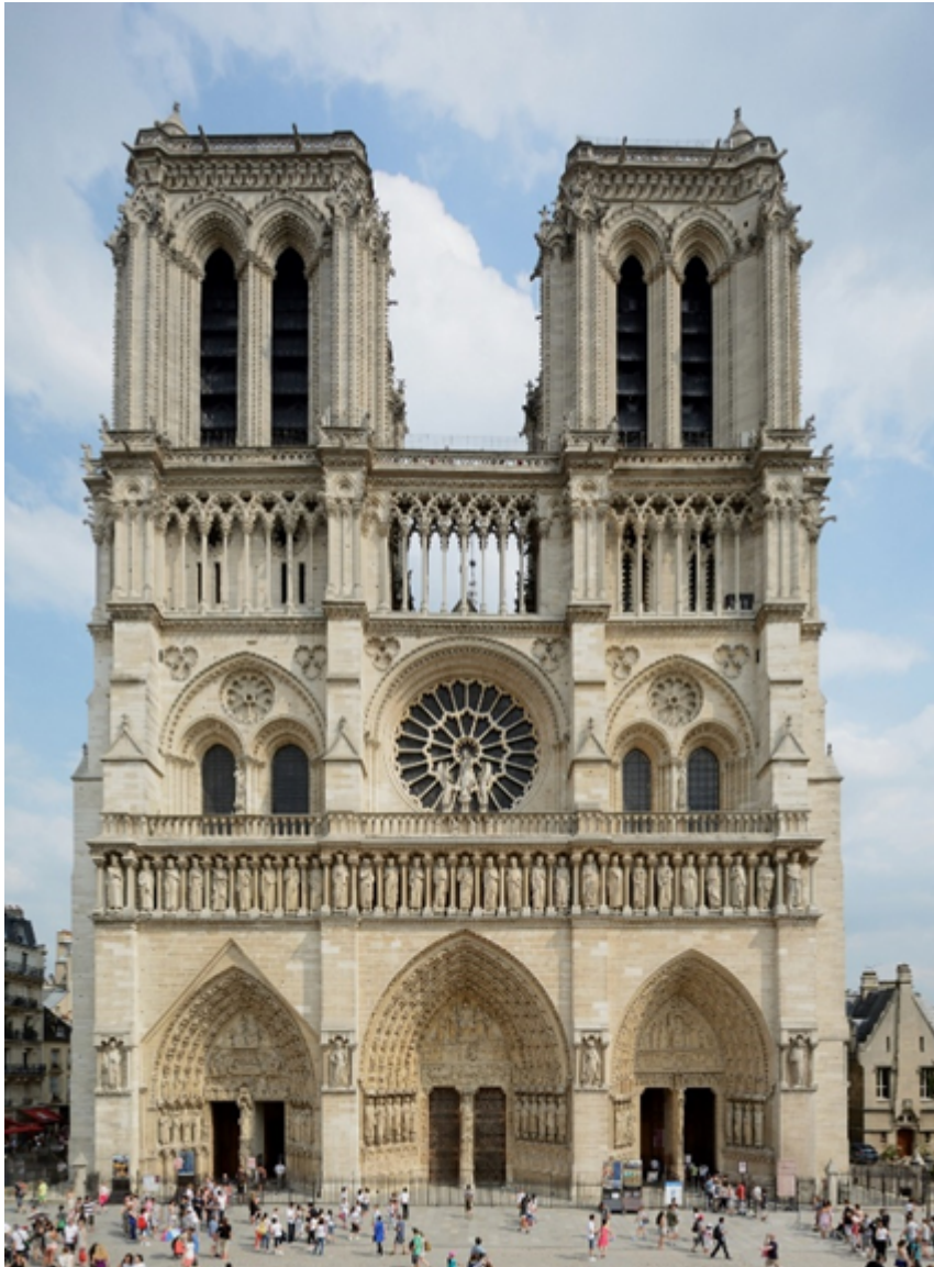
Image: Notre Dame Façade, like many churches featuring the triptych door assembly and in this case also the sun/ rosette window over the middle “equinox door” This is seen in many temples worldwide.

Image: This illustration from the Chicago Tribune - related to an article on Chicagohenge - shows someone looking toward sunrise.