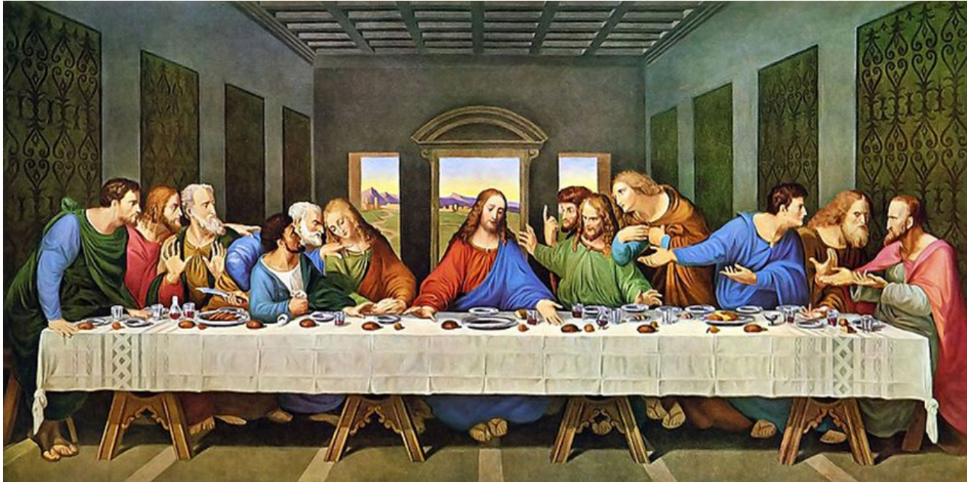
Image: Leonardo da Vinci's last supper which encodes the astronomical origins of the Jesus and the 12 apostles story. Note the finger of John pointing upwards, a clue towards the heavens.

The triptych symbolism in religious buildings and art. An astronomical clock.